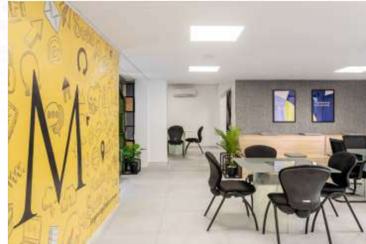
Training Room 1